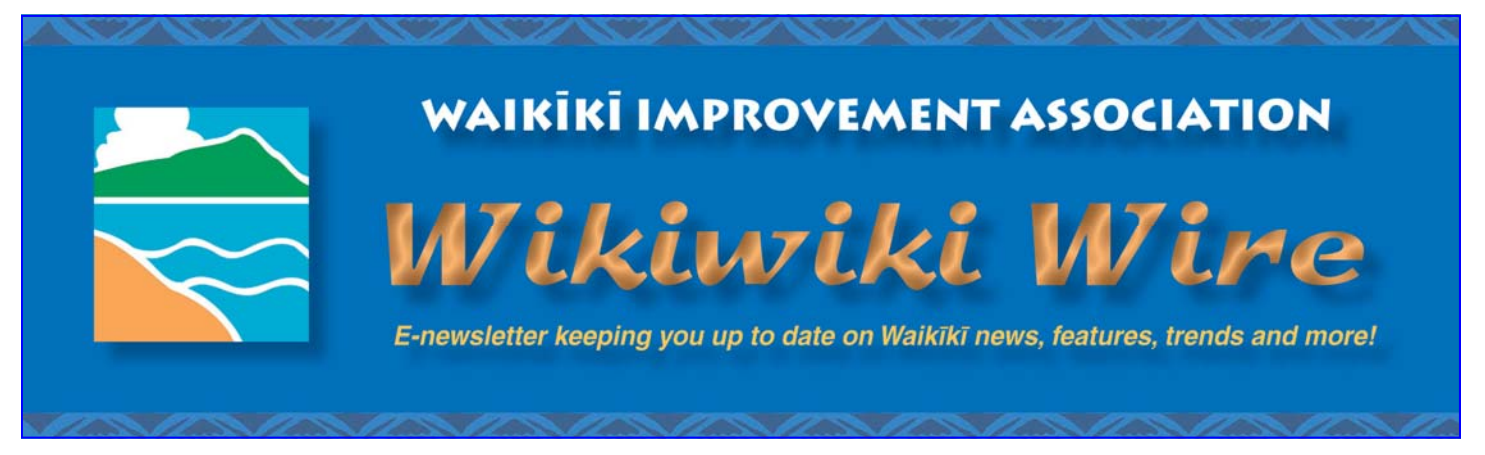
Volume XVIII, No. 08